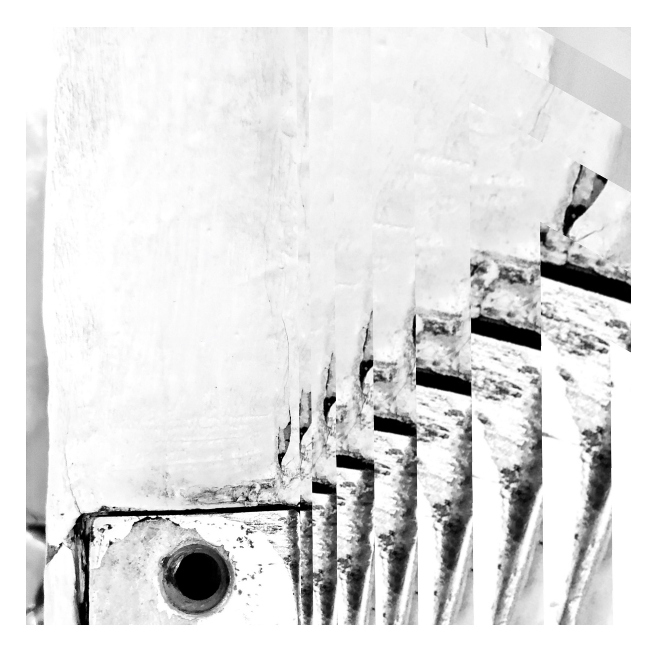
San Francisco Tape Music Festival